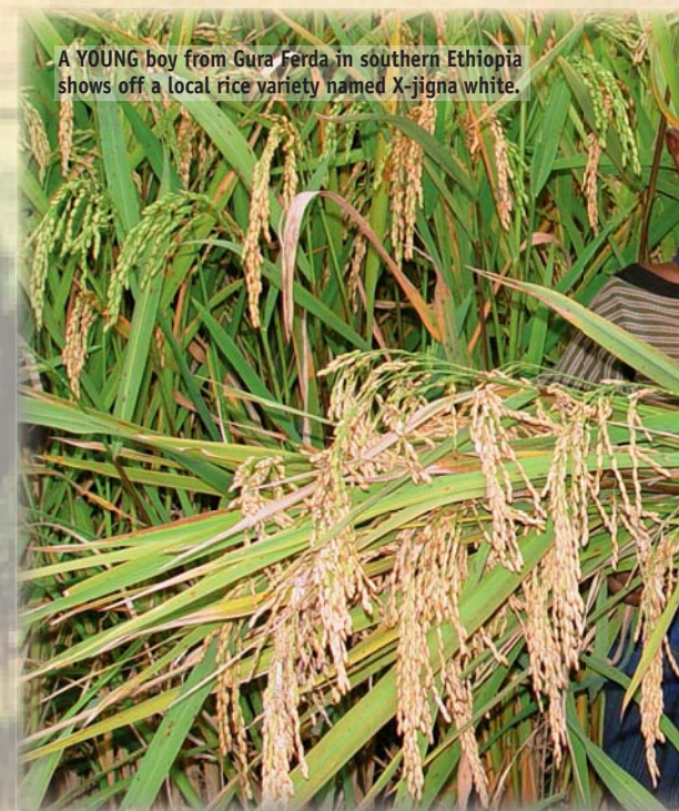
A YOUNG boy from Gura Ferda in southern Ethiopia shows off a local rice variety named X-jigna white.

The recent surge in demand for rice combined with the skyrocketing import price challenged the country's