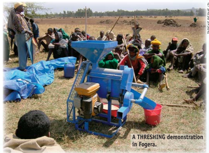
A THRESHING demonstration in Fogera.